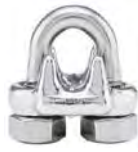
SS-450 (316 Stainless Steel)