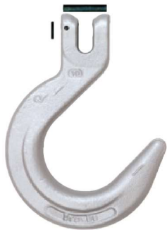
A-1359 Clevis Foundry Hook